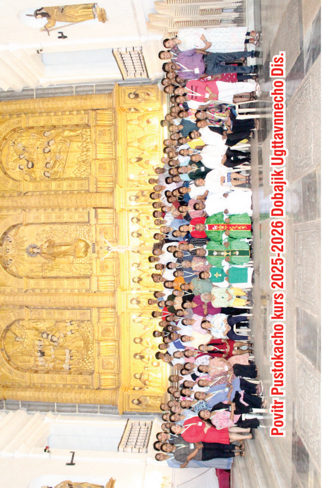
Povitr Pustokacho kurs 2025-2026 Dobajik Ugtavnnecho Dis.